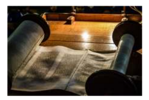
The scrolls are written in Hebrew.

These are the Torah scrolls, they read from these each week throughout the year. The pages are made of parchment and are not allowed to be touched by hand, so they use a special pointer to keep their place.